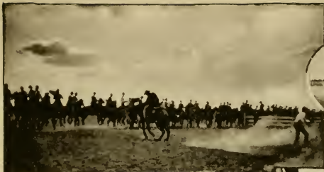
A RUNNING BUCKER.